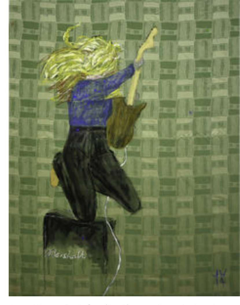
Jenny Watson Rock Star (detail) 2014 oil, synthetic polymer paint and Japanese pigment on rabbit skin glue primed damask; vintage plaster duck.

I turned from the observation of the outside world to recording an inner space ... I wanted to shatter the techniques I had learnt ... to let a random uncontrollableness take hold of the work.